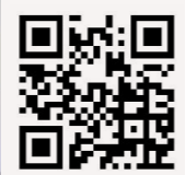
IndiGo Demonstration Video