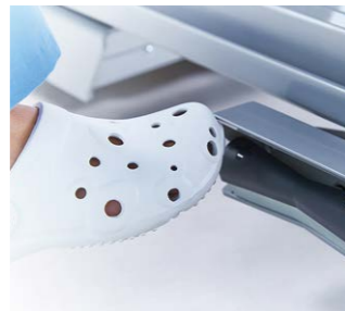
Variable height foot switch