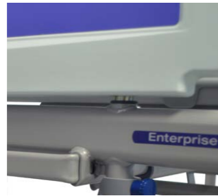
Head/Foot panel locks