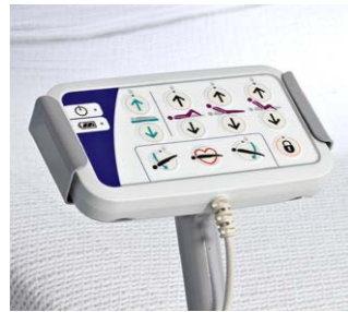
Foot end attendant control panel