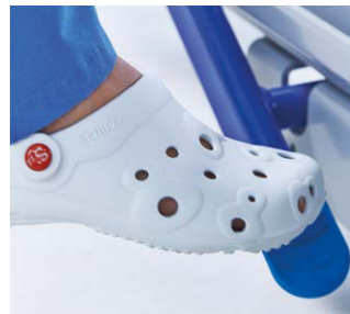
Non powered 5th wheel