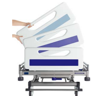
Panel colour options