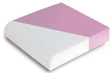
24 Hour Care Package - Seat cushion available