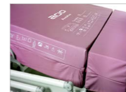
Optional Squabs - Available for extending beds