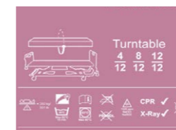
TurnTable Guide - All Pentaflex mattress replacement systems carry the TurnTable Guide