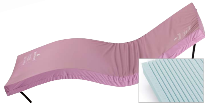
A mattress overlay is also available and is easy to install